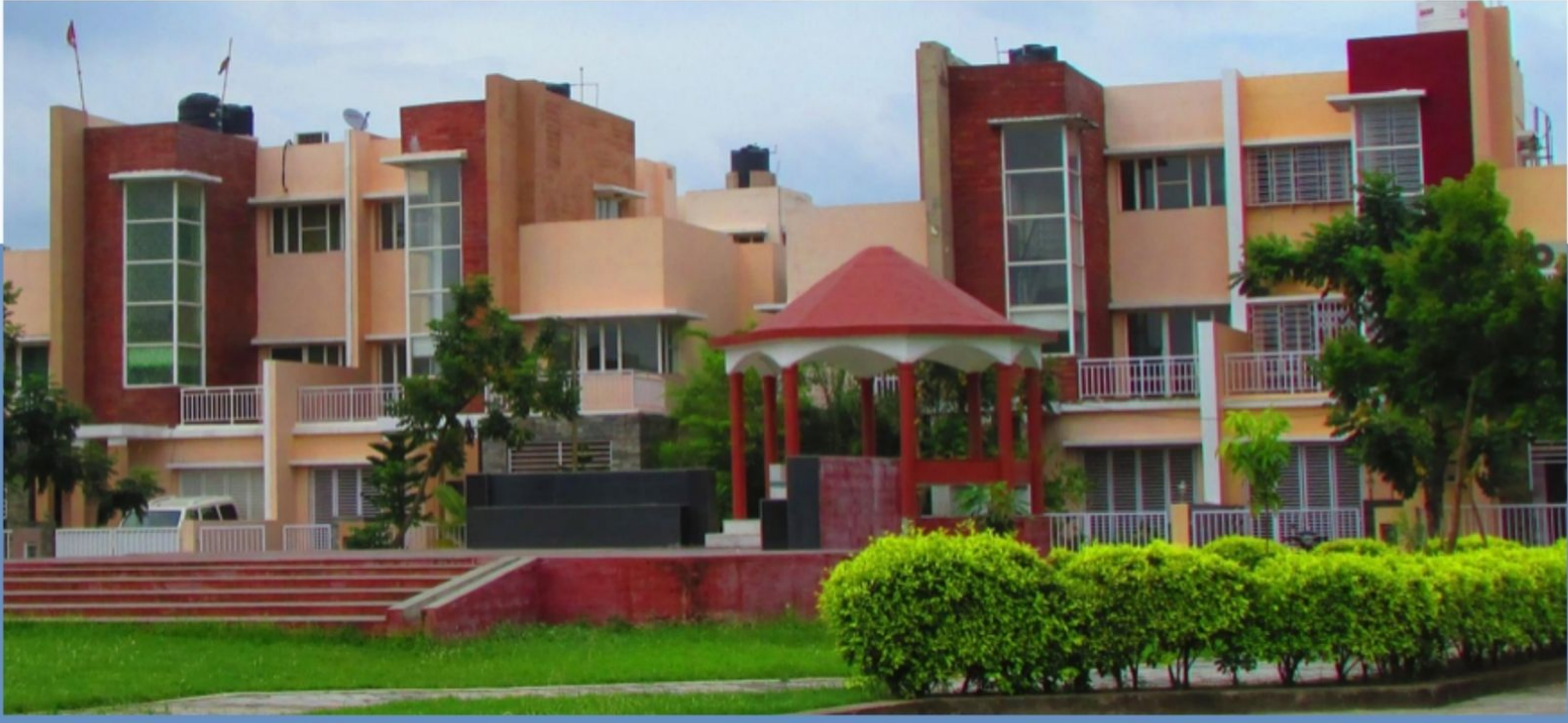
Kolkata West International City