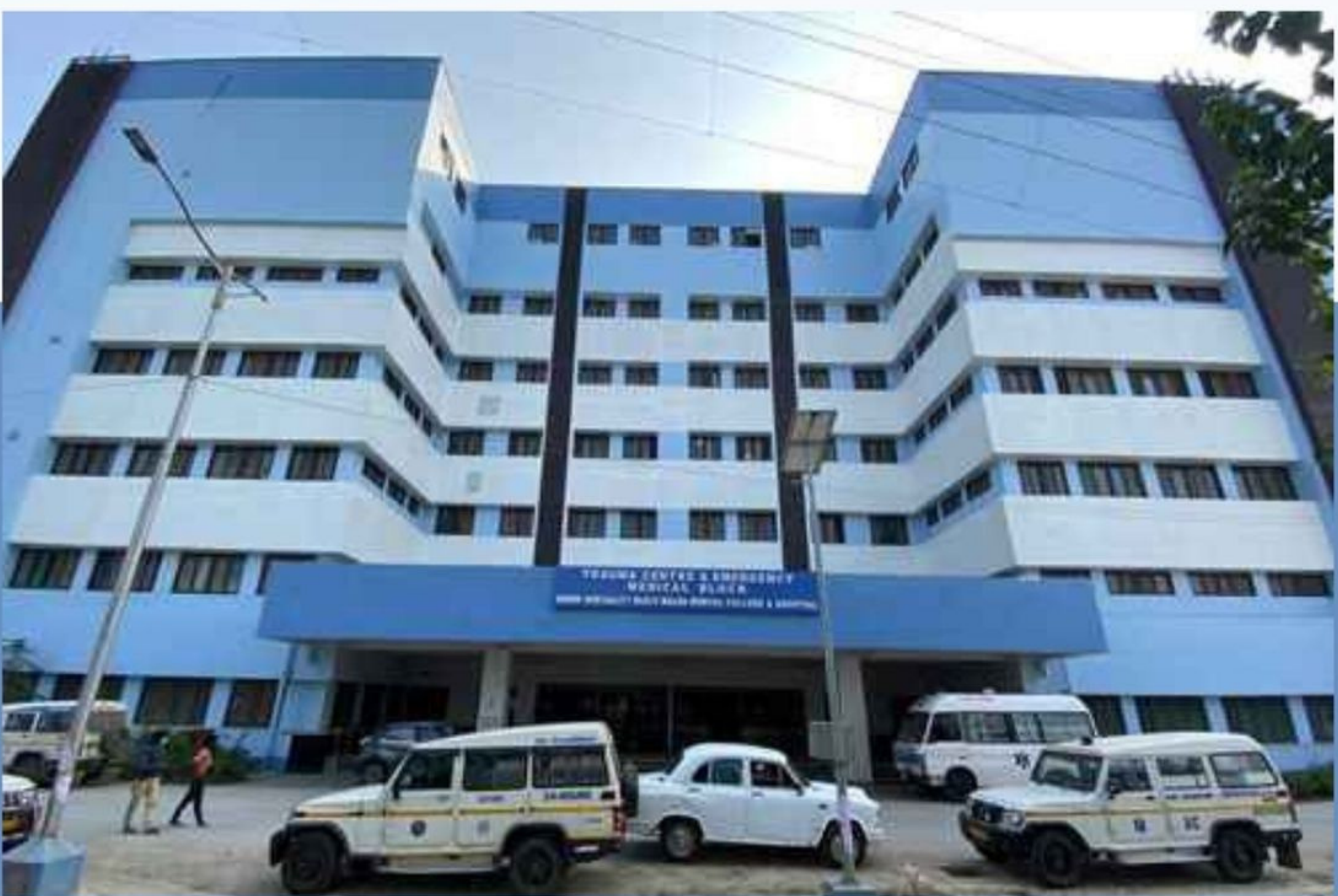
Malda Medical College by Punj Lloyd